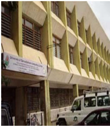
UCC Dodoma Branch Office at Mtendeni Street (BIMA House)