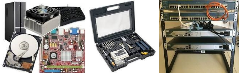
PC Components, Toolkit and Network devices